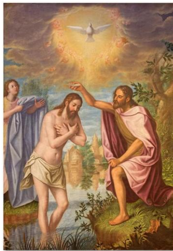
The Baptism of Christ by Juan Sánchez Cotán

In the week of the 6th of October, children will learn more about Jesus by praying the Rosary. Children will invite the Holy Spirit to open their hearts and minds as they reflect on the set of five stories and events called the Luminous Mysteries - the Mysteries of Light!