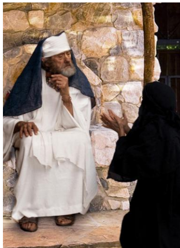
Image 2 Persistent Widow by Free Bible Images . Licensed under CC BY SA 4.0

The assembly for the third week of October focuses on persistence, and especially persistence in prayer. Through explorations of the parable of 'The Persistent Widow' and the fable, 'The Tortoise and the Hare', children will discover that prayer leads to a deeper friendship with God.